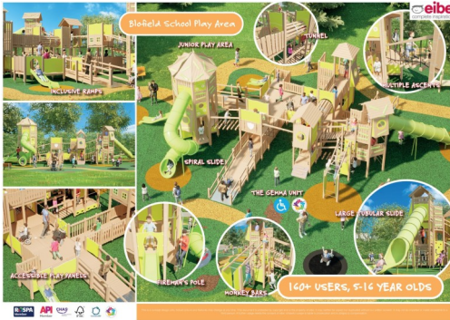
EIBE—Initial proposal for the old school site

As the population of the Parish continues to grow, there is inevitable pressure on our existing, well used village halls, and increasing demand for new community facilities. The Parish Council currently holds significant section 106 and CIL monies accumulated over several years and it is the intention to use these funds to invest in new facilities at the old School site, which will be transferred from Norfolk County Council to the Parish Council on completion of the new school.